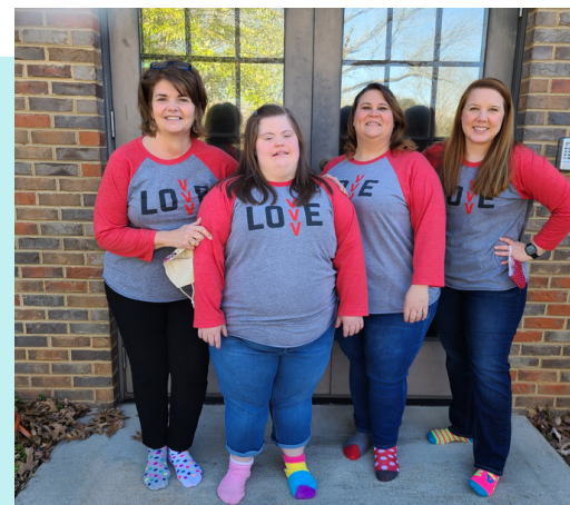
The Shelbyville Family and Community Education (FCE) Club stopped by this past fall to donate several hand-crafted fidget blankets for CCA and EI children. We are so grateful for their generosity!

Pull out your calendars and get ready to celebrate! March 21st, 2023 is World Down Syndrome Day. Established in 2006, this special holiday is meant to highlight and promote awareness of Down Syndrome, a condition in which individuals have an extra, or third, copy of chromosome 21.